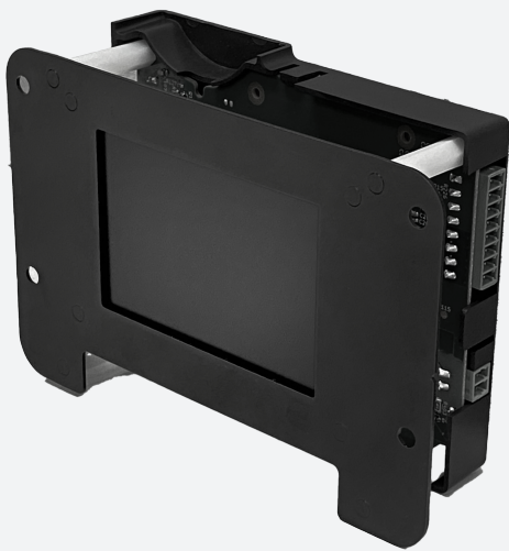
Modular Elevator Unit 7200M

The 7200M Modular Elevator Unit is a flexible solution for elevator cars requiring two-way visual communication. It allows an external USB camera and elevator emergency phone to be utilized with the SmartView 2 platform to make the most of the space in the elevator panel. The 7200M Modular Elevator Unit also has inputs for the yes / no buttons to allow a trapped passenger to answer text messages that are displayed on the screen.