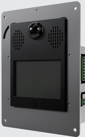
All-in-One Elevator Unit 7200

The 7200 All-in-One Elevator Unit is a combined audio and visual communication system providing complete ADA compliance within the elevator car. The unit comprises of a display, camera, microphone, and speaker all within one compact housing. The SmartView 2 Elevator Unit also has inputs for the emergency call button and yes / no buttons to allow a trapped passenger to answer text messages that are displayed on the screen.