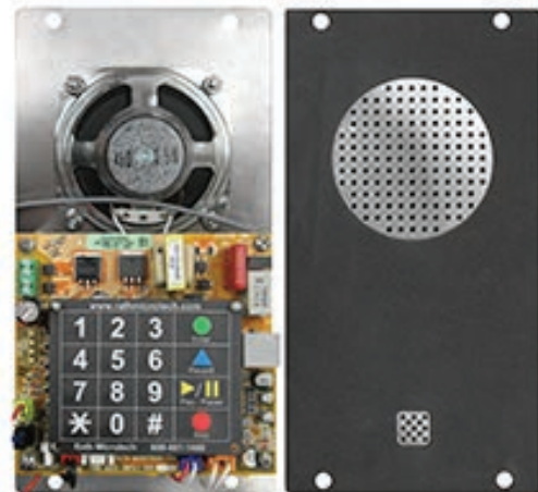
Part #: 2100-957CC Dimensions: 8-1/3" H x 4-1/2" W x 2" D